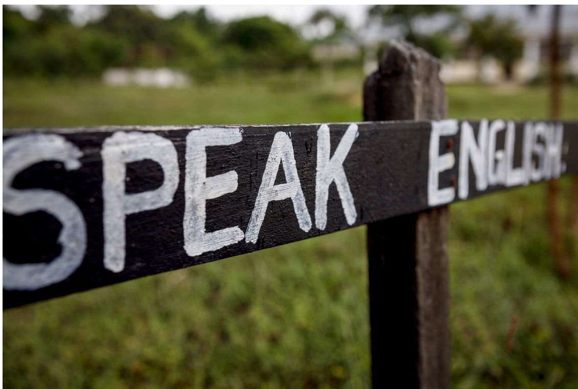
A sign outside a school in Dar es Salaam.