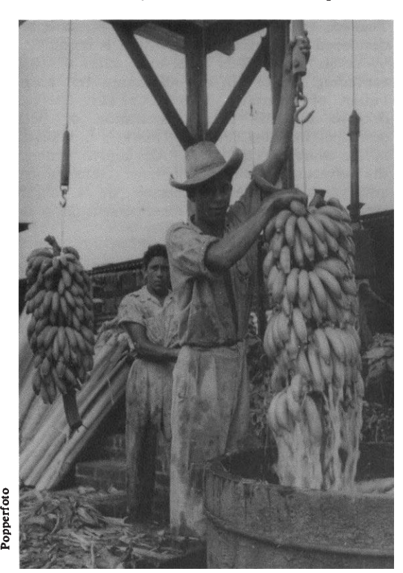
Banana washing station in Escuintla, Guatemala.

International trade in bananas is integrated in the sense that a few large companies are dominant in several stages of production and distribution. Seventy per cent of world trade is controlled by three TNCs; United Brands (35 per cent), Standard Fruit (25 per cent) and Del Monte (10 per cent). With the exception of Ecuador, the large-scale foreign-owned plantation unit has been a dominant feature in Latin America and the Caribbean (UNCTAD 1978: 21). In the case of both the United Fruit Company (UFC) in Central America and its main competitor Castle and Cooke (a large food conglomerate which owns 84 per cent of the shares of Standard Fruit), bananas are only one of a number of products