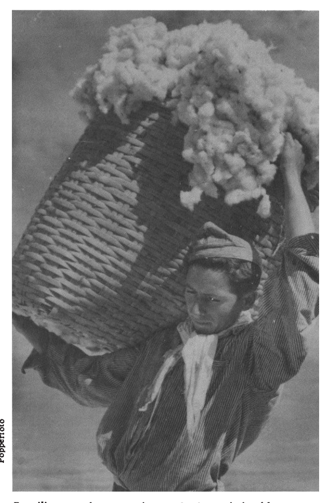
Brazilian worker carrying a basket of freshlypicked cotton.