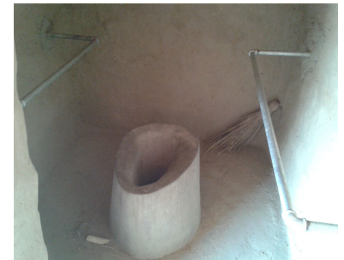
Fixed toilet seat with handrails. Rails could be made from wood to reduce cost.