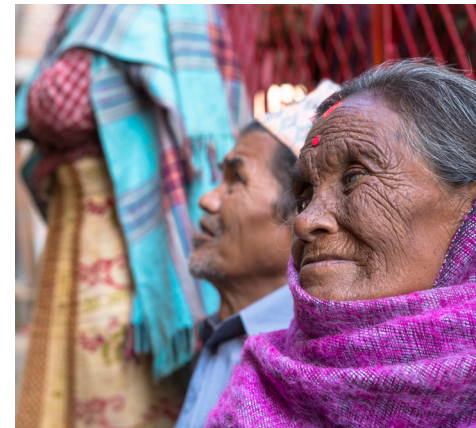
Consultations with elderly men and women, Kathmandu, Nepal.