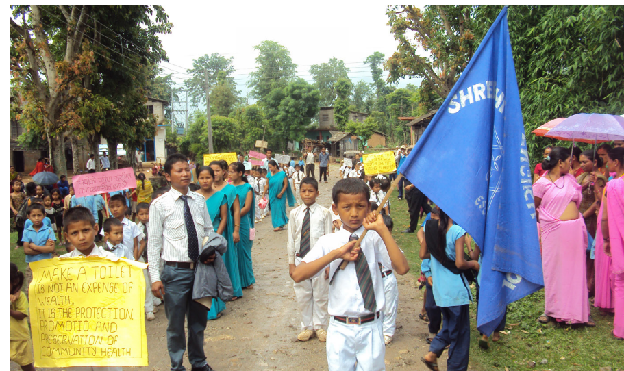
Behaviour change campaign in Nepal. Placard reads 'Make a toilet. Is not an expense of wealth, it is the protection, promotion and preservation of community health'.

CLTS contributes to the realisation of the right by working with communities to enable them to reflect critically on their state of sanitation and how they could draw from their own resources to improve it, taking action at both the individual and community level. Given the reality of generalised absence of mechanisms for safeguarding these rights, and the reality in most countries of limited state resources or lack of prioritisation of sanitation, this focus on community-based initiative is indispensable. This does not negate the role and responsibility of the State to its citizens. The need to establish adequate regulations, to create an enabling environment, and enable people to exercise their right to sanitation are central state obligations, and ones that CLTS activities and the WASH sector can contribute to through advocacy and awareness raising.