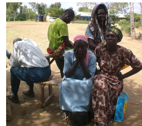
A CLTS process organised by Plan International in Bondo, Kenya in 2007.