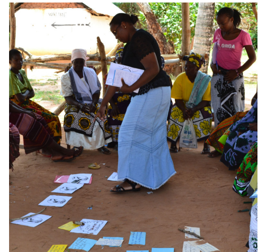
Women Leaders Meeting, Kilifi, Kenya.

CLTS calls for collective re-examining of individual behaviour that has community-wide impact. OD or unhygienic toilets have a negative impact on the individual as well as their neighbours. CLTS relies on peer accountability in achieving ODF status, and then moving up the sanitation ladder toward the highest attainable standard of sanitation within a given social and economic context. Those who take issue with peer accountability view it as subordinating the individual to the community's