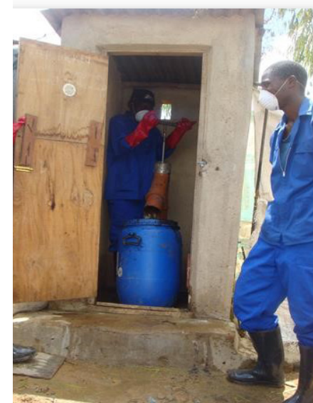
Faecal sludge management in Malawi.

CLTS counts on the State to be effective in playing its role to ‘protect’ rights by creating the necessary regulatory environment. This is most visible in urban CLTS, whose emphasis is on catalysing community advocacy to get actors to take up their respective responsibilities: landlords of both residential and business premises, frontline public health officials, departmental supervisors within city government, legislators and policy-makers (see for example, Murigi et al 2015). Faecal sludge management is an area of growing interest in urban settings. It is also considered the responsibility of government to ensure that appropriate options for collection, treatment, disposal or reuse of excreta are utilised (McGranahan 2015; Myers 2015, Musyoki 2012 4 ). This does not mean services should