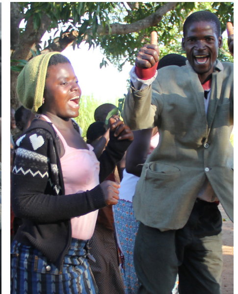
CLTS triggering in Malawi, May 2015.