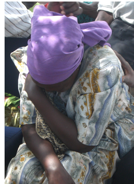
A CLTS process organised by Plan International in Bondo, Kenya in 2007.

In order to ignite a change in sanitation behaviour, the triggering phase of CLTS often invokes a sense of disgust and shame (and concurrent positive emotions like pride, self-respect and dignity) that lead a community to resolve to take collective action. Disgust in CLTS has not generally been controversial, but the experience of ‘shame’ has attracted criticism from a human rights perspective (Engel and Susilo 2014; Galvin 2015). In the following table, we attempt to distil from decades of research in order to discuss the different concepts of shame and disgust. The summary is by no means exhaustive, but we hope to establish the core meanings and their relationship to the CLTS process, particularly during triggering.