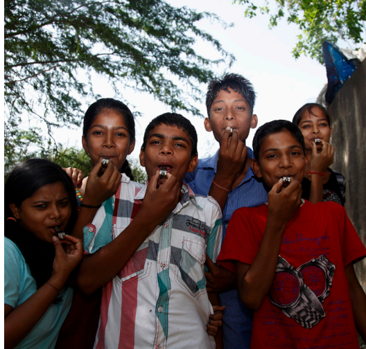
Youth monitoring open defecation.

With community-imposed sanctions, there is a tension between safeguarding a community's decisional autonomy and ensuring that abuses are not thereby carried out in the name of CLTS by the community. Government instigated sanctions motivated by the need to meet public health targets can also distort and undermine CLTS and disempower the community. They can also potentially lead to law-breaking and violation of rights, as was the case