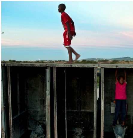
Two boys play on burnt out communal toilets in BM Section of Khayelitsha after a fire swept through the informal settlement.

be given to all free of charge: 'Individuals and households should be expected to contribute to the costs of services, which should be differentiated according to ability of households to pay' COHRE et al (2008: 2). In rural settings too, CLTS relies on the state's duty to protect and fulfil (in terms of creating an enabling environment), whether this is explicit or implicit. Public health regulations might be engaged to take action against wilful refusal to stop disposing of waste into rivers, for instance.