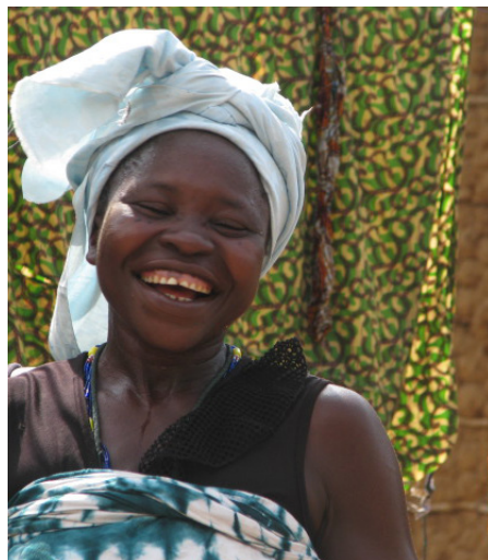
A woman laughs at how much shit her neighbour produces in a day, Port Loko.

Discussion among CLTS practitioners has brought about an emphasis on training and coaching for good facilitation skills that enable one to discern and manage possible negative consequences (Musyoki 2007; Musyoki and Winarta 2012). Local facilitators, or facilitators who have some prior relationship with the community have an advantage because they are more likely to be accepted as a ‘critical friend’ and will have a better sense of acceptable boundaries (Musyoki 2007). The CLTS Handbook expresses a preference for local facilitators such as Natural Leaders 10 from one village moving on to trigger a neighbouring one (Kar with Chambers 2008: 69-73). Local facilitators in Pakistan, for instance, after working with CLTS methods for a while, decided that