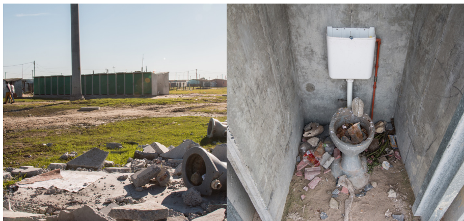
Social audit in four informal settlements in Khayelitsha, South Africa, July 2014.

duty. It has long been understood by people working in the field of economic and social rights that state obligation is about much more than material provision and delivery. 3 State obligation is thought of as consisting broadly of three levels: respect , protect and fulfil .