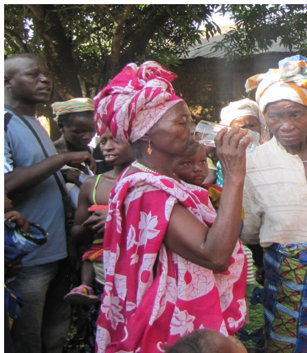
CLTS triggering in Bombali, Sierra Leone.

gathering is then invited to ‘congratulate’ the family that produces the most for their contribution to the village, while the least productive is ‘encouraged’ to produce more (Kar with Chambers 2008: 33). This is intended to make the process humorous and light, but it may very well offend some people. A facilitator must have training in order to judge how far is far enough, or whether to do away with the ‘shit ranking’ altogether, since the crucial point is to depict the magnitude of the problem overall.