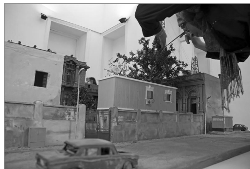
Two photos by Heba Khalifa, Changing Focus participant

this framework, looking to participating photographers as researchers working to conceptualise gender empowerment.