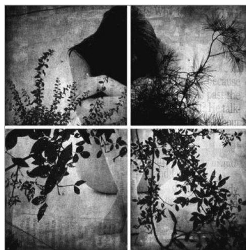
Three photos by Marwa Adel, Changing Focus participant

messages. Changing Focus acknowledges these paradigms and thus asked participant photographers to discuss their images and what they wanted to convey. This process does not rule out other interpretations but allows the photographers to explain their representations of women so audiences have access to their point of view.