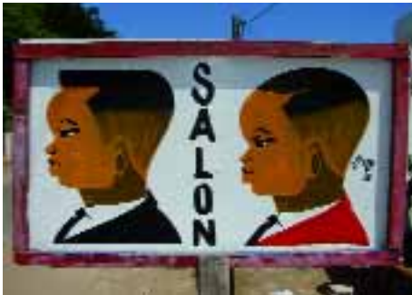
Barber's sign, Dakar

Raewyn concluded by emphasising that studying the historical and contemporary forces that continue to shape gender ideologies and their practices is a critical aspect of politicising work with men on masculinities. Such studies reveal not only the reality of gender change but also the necessity of working for such change not merely through personal change work with individual men, but also through political engagement with structures of male power. Subsequent sessions explored the nature of and relationship between such personal change and political engagement.