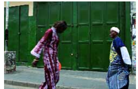
Street scene, Dakar

* Submitted papers but were unable to attend the symposium.