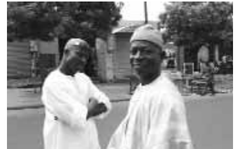
Street scene, Dakar