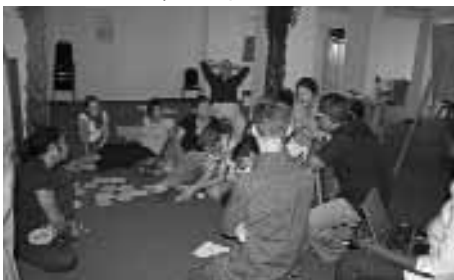
Participants discussing how to problematise heteronormativity during SOSOTEC

The groups were tasked with identifying the tools and alliances needed to implement the strategies devised on day three, and the processes required to develop them. The rich thinking and possibilities that emerged from the affinity group discussions is explored in detail starting on page 31.