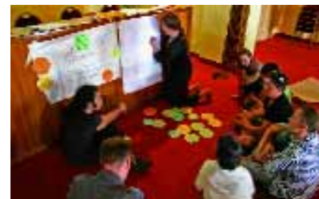
Immersed in SOSOTEC