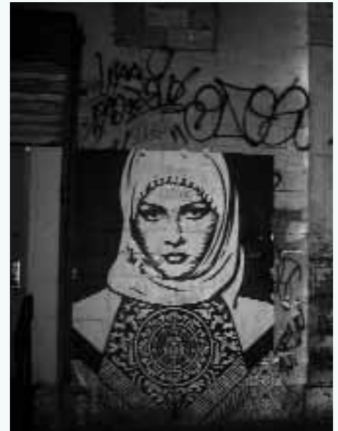
American graffiti in Gansvoort Street, New York, 2007

Collectivity Patterns of masculinity can be understood at the individual level, but it is important to recognise that they also exist at the level of social collectives. Masculinities can be institutionalised in organisations (e.g. armies, trades, bureaucracies) or informal groups (families, friendship networks), and expressed in shared cultural forms (myths and folklore, mass media, social stereotypes). The collective reality is well demonstrated in organisational ethnographies of schools and military organisations. This collective reality is an important reason why change in gender practice among men and boys is hard to start simply by persuasion. An individual man may be willing, but the institutional setting, or the peer group culture, pushes in the other direction.