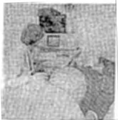
Nurse using a computer to examine a pregnant mother

There are many computer programmes which nurses can use in their day to day duties. French (1993) suggests the following computer programmes that are useful to nurses