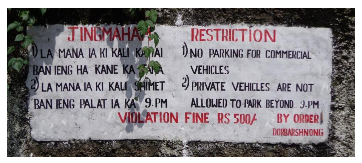
Figure 4.1 Notification by dorbar shnong , village council