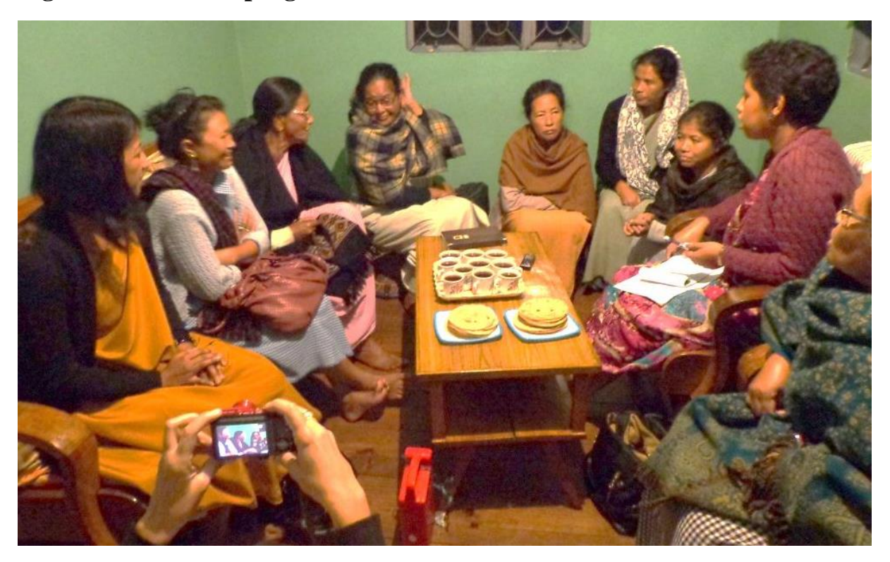
Figure 3.1 FGD in progress