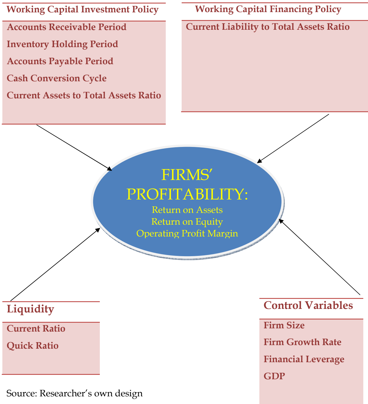
Figure1: Conceptual framework for analysis

From the literature review mentioned above, the researcher has developed the following schematic representation of the conceptual framework/ model for this study: