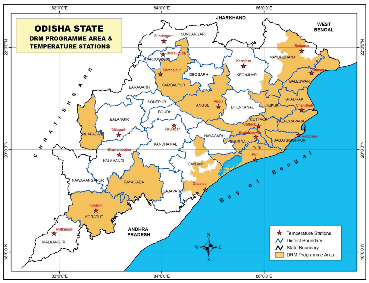
Figure 1: Location of districts covered under the Disaster Risk Management program in Odisha