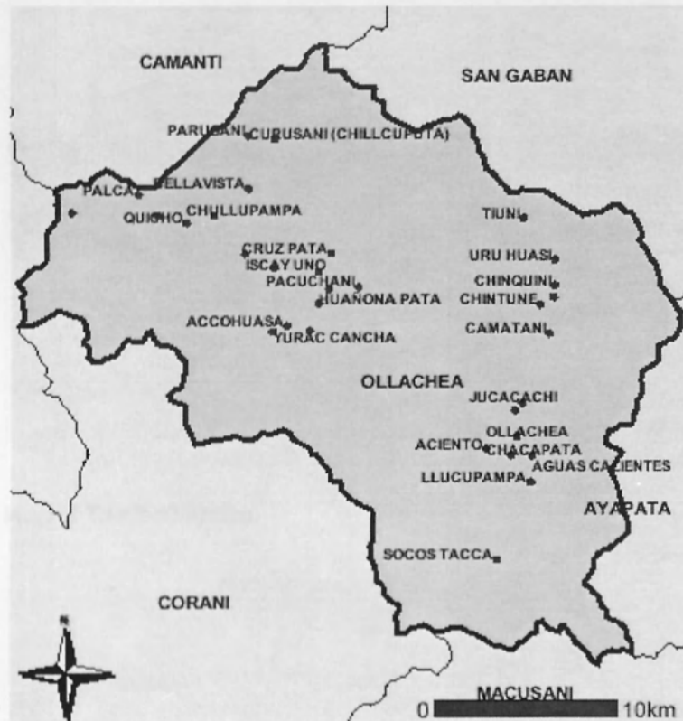
Map 5 Ollachea