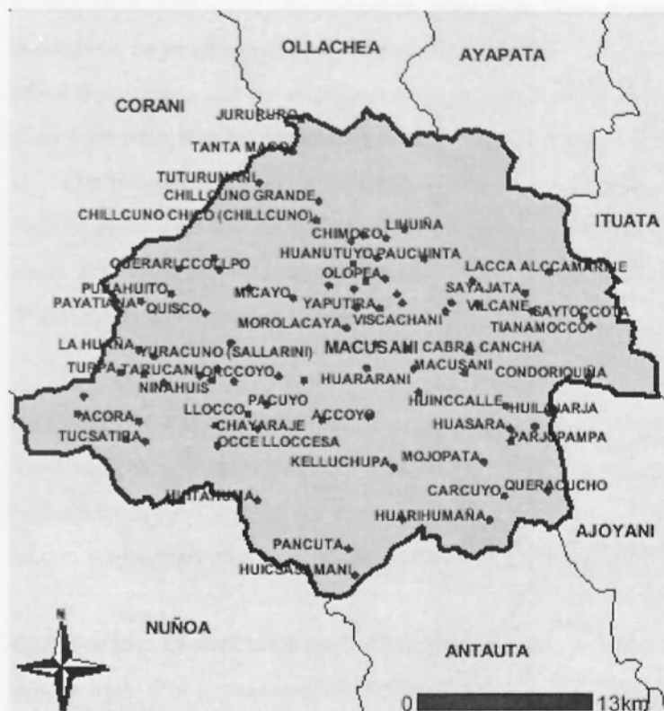
Map 4 Macusani

Reproduced by kind permission of Instituto Nacional de Estadística y Informática ( www.inei.gob.pe ).