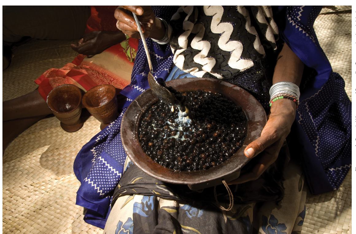
The coffee ceremony among the Borana and Gabra is symbolic of peace.

The research was funded by the UK government, through Pastoralist Consultants International (PCI), the Institute of Development Studies (IDS), and the Future Agricultures Consortium. Throughout the five-year peace process and during the research process presented in this paper, PCI consultants operated in partnership with local leaders and took a considerable part in organising most of the large events detailed here. In Ethiopia PCI was based within the United Nations Office for the Coordination of Humanitarian Affairs in Addis Ababa. In Ethiopia and Kenya PCI's team of consultants operated in partnership with the Oromia Pastoralist Association (OPA) and the Pastoralist Shade Initiative (PSI) respectively.