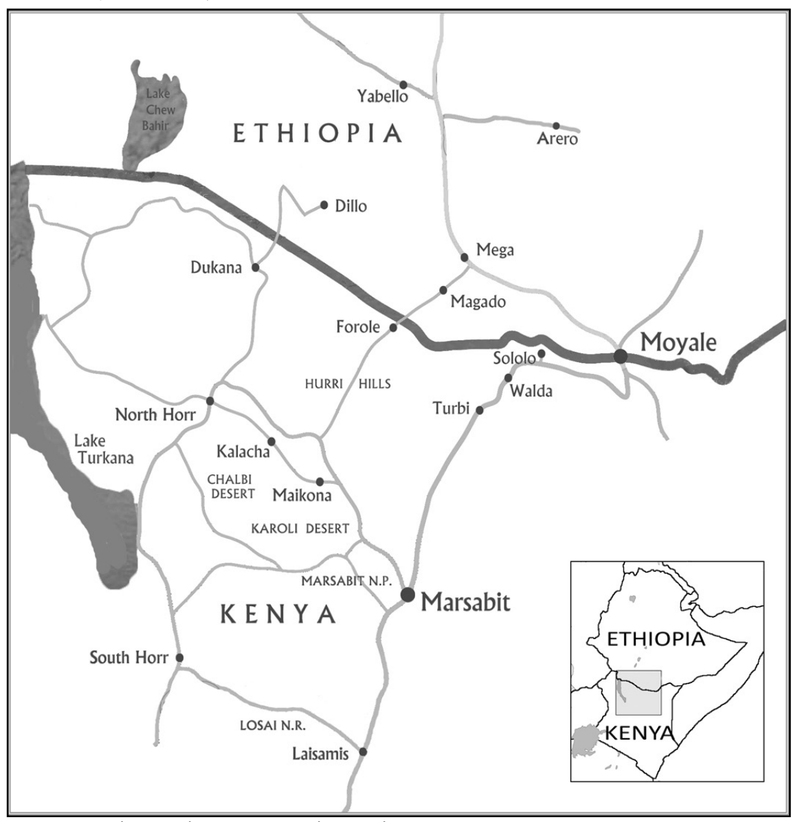
Map showing northern Kenya and southern Ethiopia<sup>1</sup>