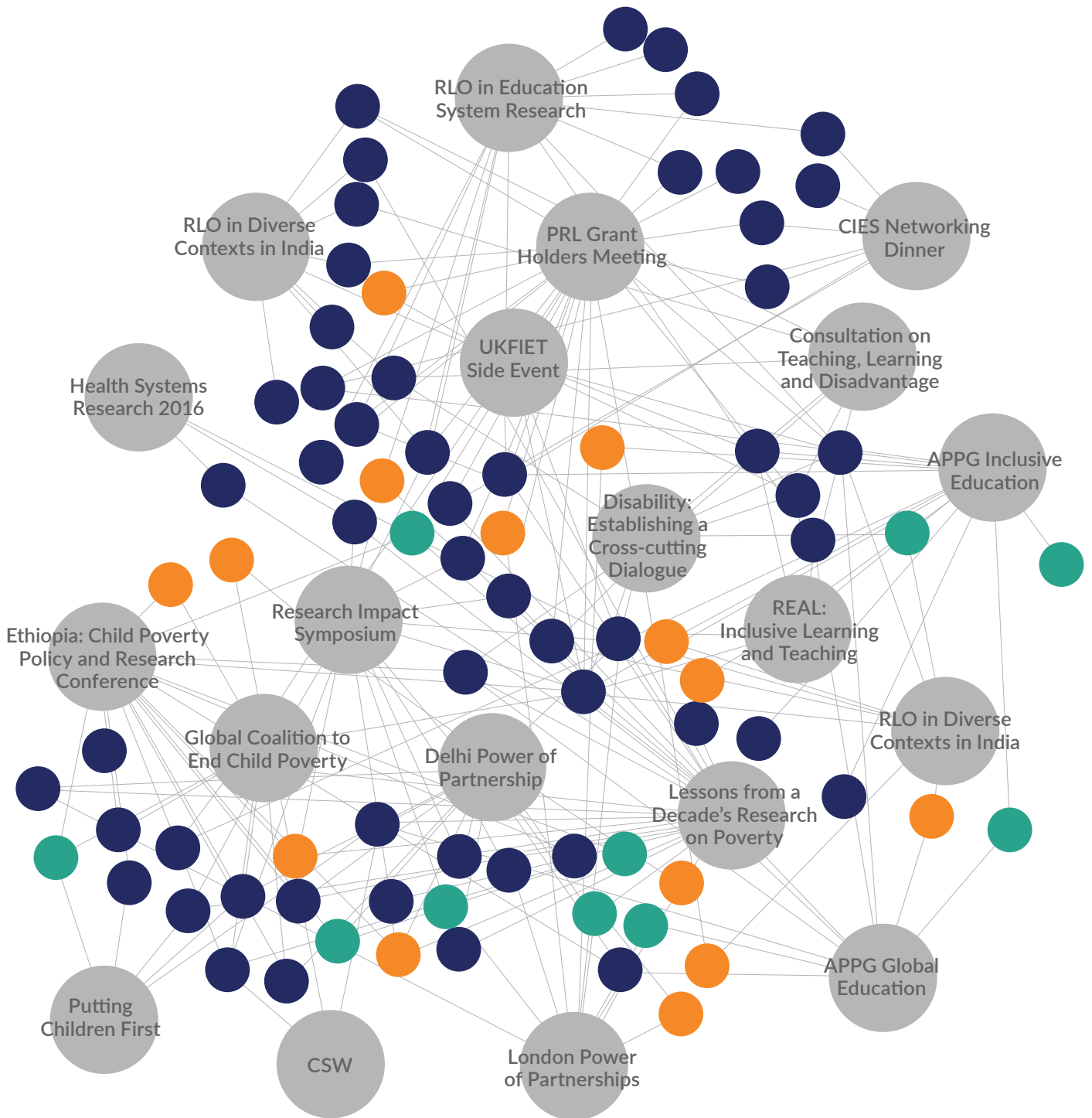
Figure 3.2 Repeat participants at Impact Initiative events