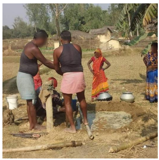
Figure 2 Improved access to drinking water

Action 2: The ARG learned that landless households must pay Rs. 1,000 to the electricity company to get individual access to an electricity meter. There is no regular state subsidy for this