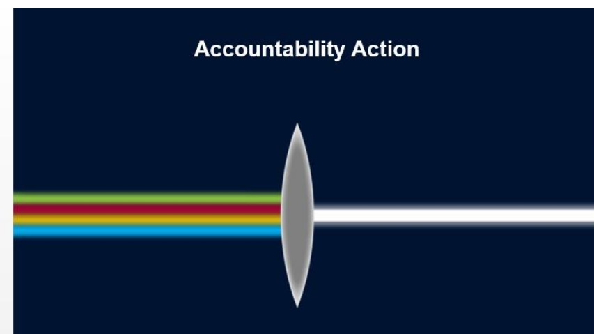
Fig. 2 Accountability Action

Following on from the refraction of accountability into its distinct wavelengths, Nelson encouraged workshop participants to think about the next step, that by taking into account the broad spectrum of accountability relationships and focusing our actions on the interconnection of relationships (versus working on accountability in disconnected and disparate silos), it would become possible to generate greater health equity.