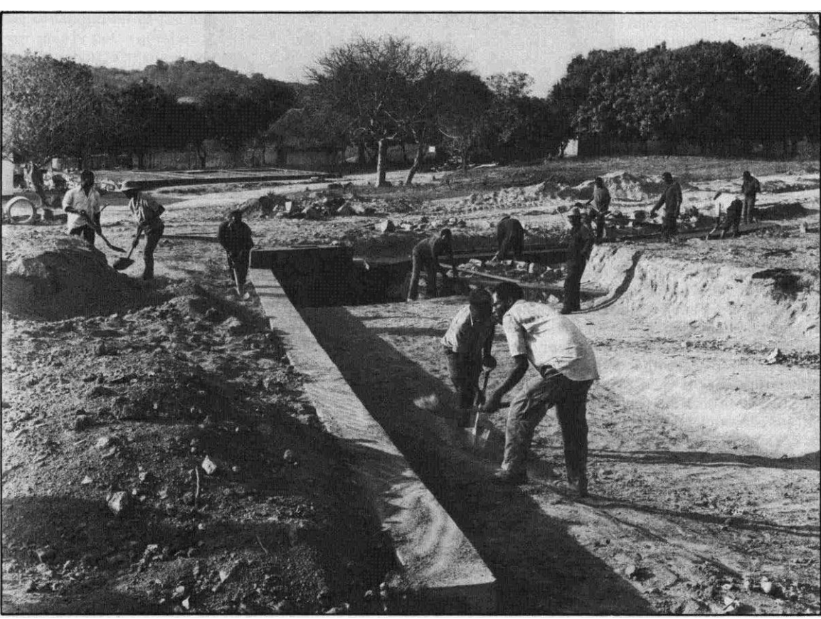
'Food for Work' schemes avert crises.