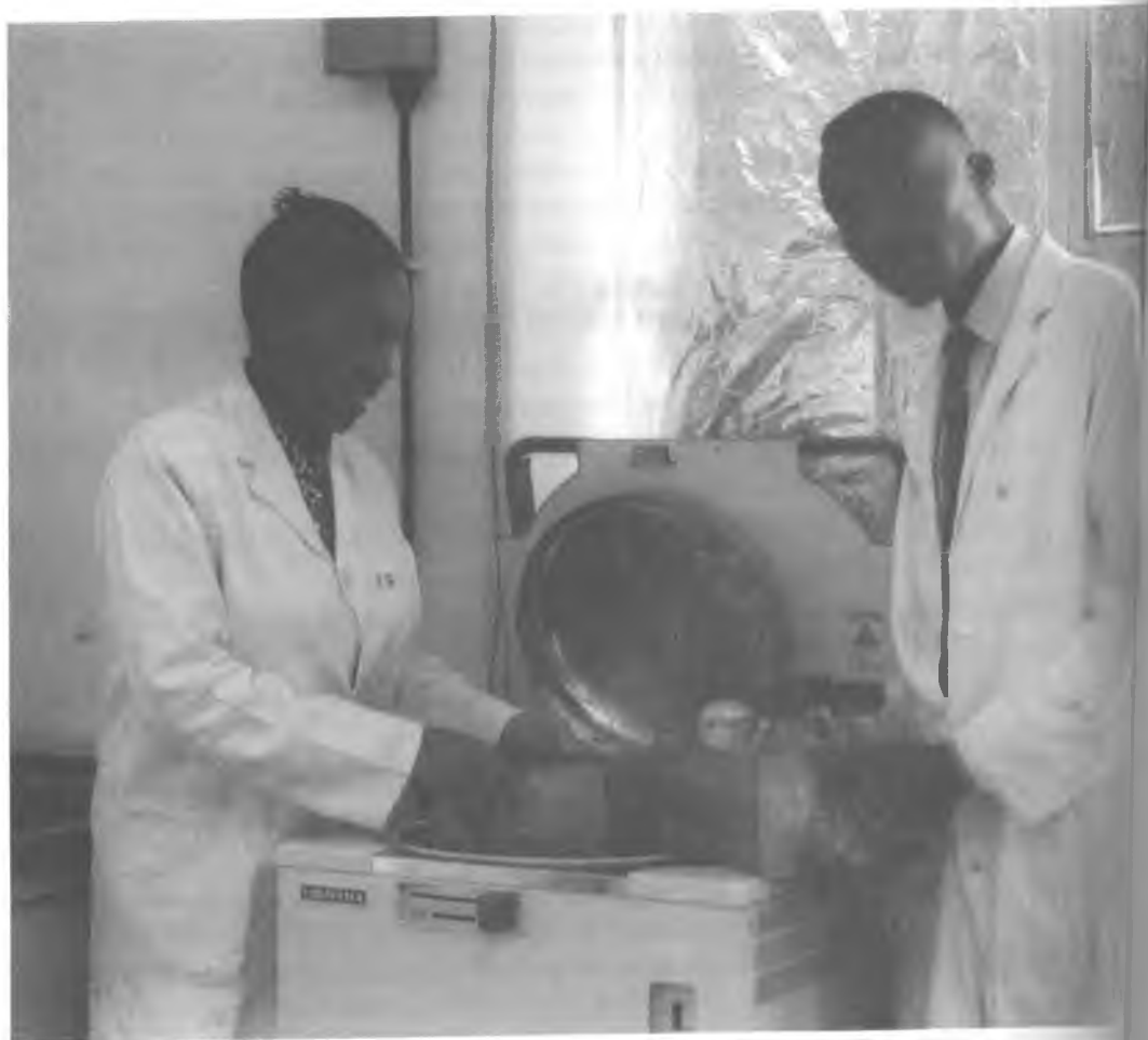
Biotechnology offers an alternative science to agriculture