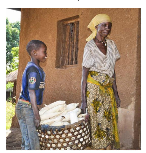
↑ Carrying the basket of maize, Chiwerere village.

A rapid review of manifestos from two of the popular parties in Tanzania namely "Chama cha Mapinduzi" - (CCM) and "Chama Cha Demokrasia na Maendeleo" - [CHADEMA] has shown that both parties have included nutrition as one of their manifesto components. For CCM, its manifesto has put emphasis on increasing access to food and better nutrition for each household in order to reduce malnutrition. The manifesto also highlights the need to foster research on seed varieties that are nutrient dense and with higher productivity so as to have enough yield that will lead to food sufficiency and diversity. The CHADEMA manifesto has focused on reducing malnutrition in the under-fives, by designing a special feeding program for nursery school children, which in turn is expected to improve their nutrition status as well as school performance.