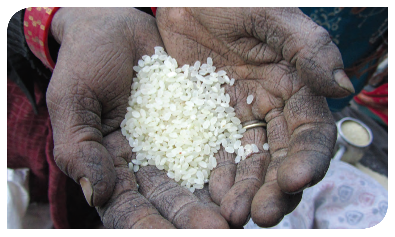
Rural woman showing rice donated by the Government of Japan to the Government of Nepal and distributed by the Nepal Food Corporation (NFC) in Gamgadi, Mugu district, Nepal